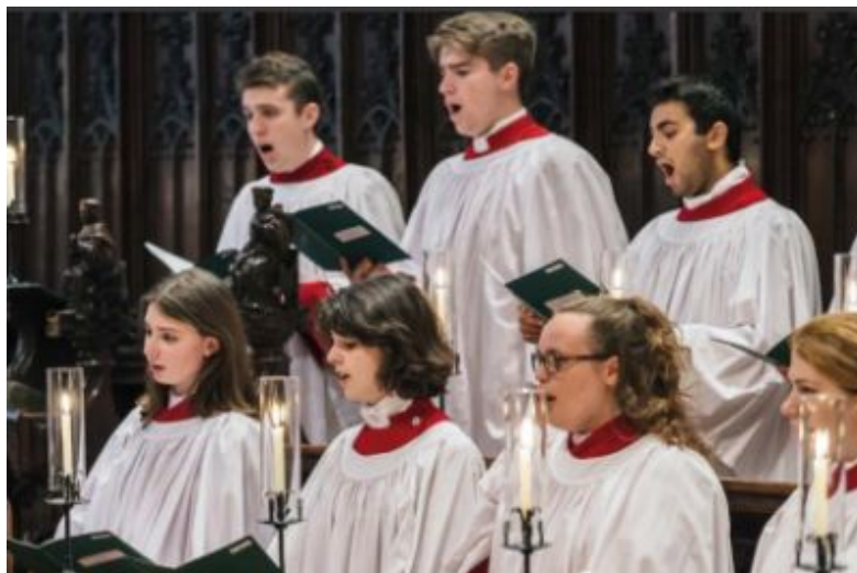
Jesus College Choir, Cambridge