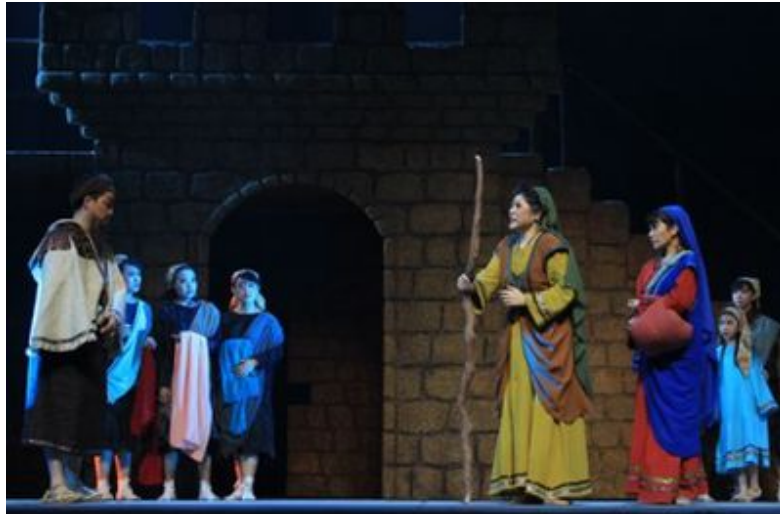
The scene where Ruth and Naomi come Back to Naomi’s hometown Bethlehem.