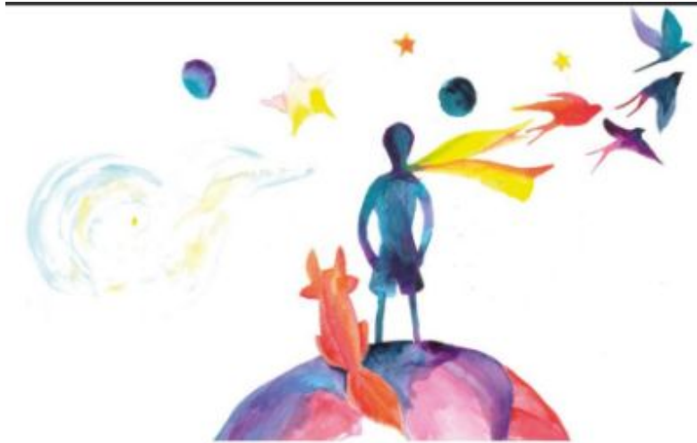
'The Little Prince'.