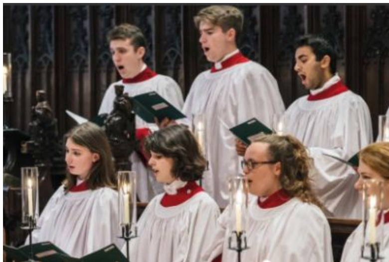
Jesus College Choir, Cambridge