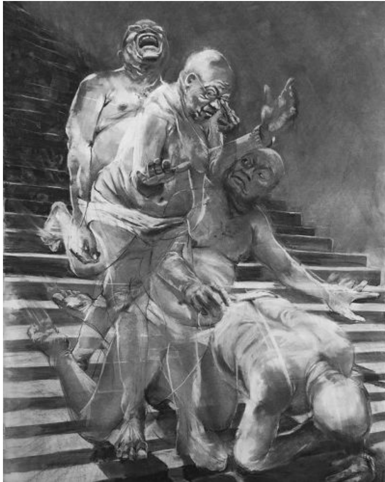
Duncan Stewart work titled Jacob's Decent will be on display at 40 Stones in the Wall Group Exhibition . (PHOTO: Spiritfest Facebook Page ).

Solid(t)ary , “a musical contemplation of modes of resistance in a world hit by flux,” was interesting and thought-provoking. It was a masterly solo performance by composer Neo Muyanga and included a gem telling of Job’s protest and God’s challenging response.