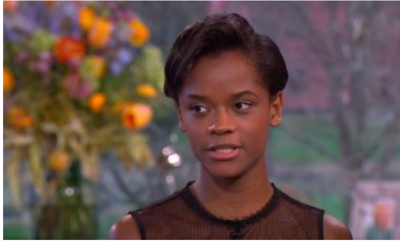
Letitia Wright.