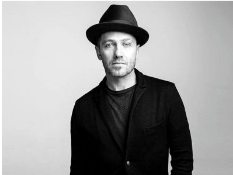
Christian musician TobyMac.