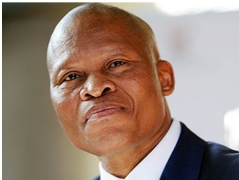
Chief Justice Mogoeng.