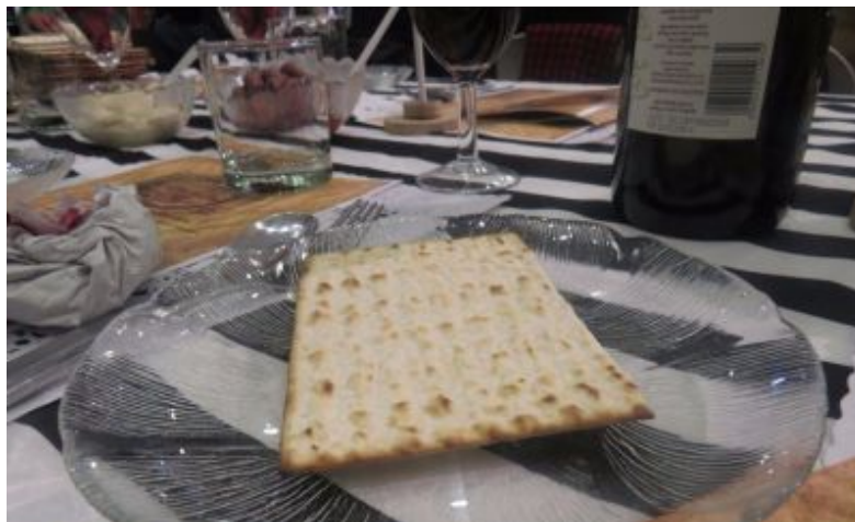
Elements of the seder meal.

The seder is about telling the Exodus story through symbolic rituals, stories and songs that are meant to bring one to imagine the hardships that the Israelites went through. Today Israel celebrates 70 years of independence since its founding as a modern nation in 1948.