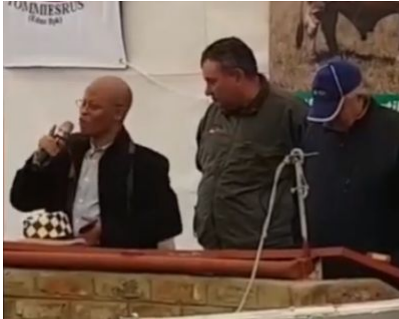
Chief Justice Mogoeng Mogoeng, left, speaking at a cattle auction in Lichtenburg. (WATCH VIDEO CLIP AT BOTTOM OF PAGE).

South Africa is on the verge of a great breakthrough and Christians who know their God can be like Daniels and Joseph's, coming up with God-inspired solutions to the nation's greatest challenges, Chief Justice Mogoeng Mogoeng said at a cattle auction in Lichtenburg on Friday.