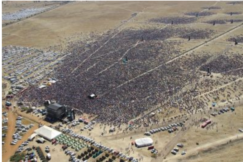
An aerial view of the It's Time gathering in Bloemfontein April 22 2017.

“Both reconciliation and repentance are necessary forerunners to revival,” said Moolman.”