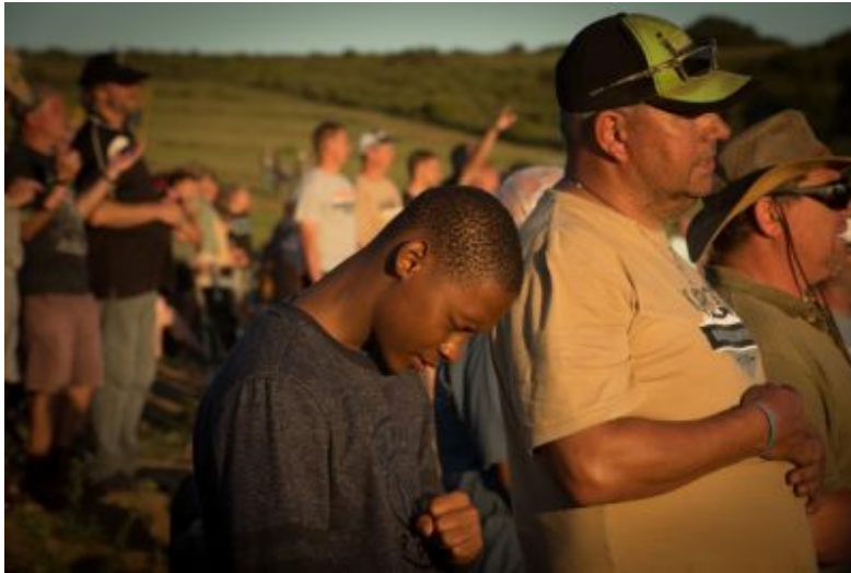
Worshipful moments at MMC EC 2018.