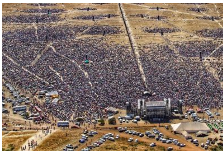
An aerial view of the It's Time gathering April 22. (PHOTO: @DrMichaelMol).