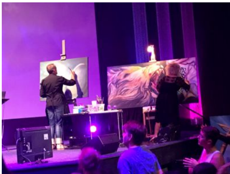
Artists at work during last week's Kingdom Come SA conference in Johannesburg.