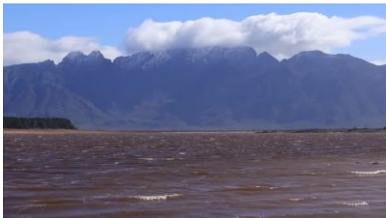
Theewaterskloof Dam in July (Screenshot of video on Cape Town Live Youtube channel). SEE VIDEO AT BOTTOM OF PAGE

A drought in the Western Cape province of South Africa began in 2015. It resulted in a severe water shortage in the region, most notably affecting the city of Cape Town, with dam levels declining to critically low levels.