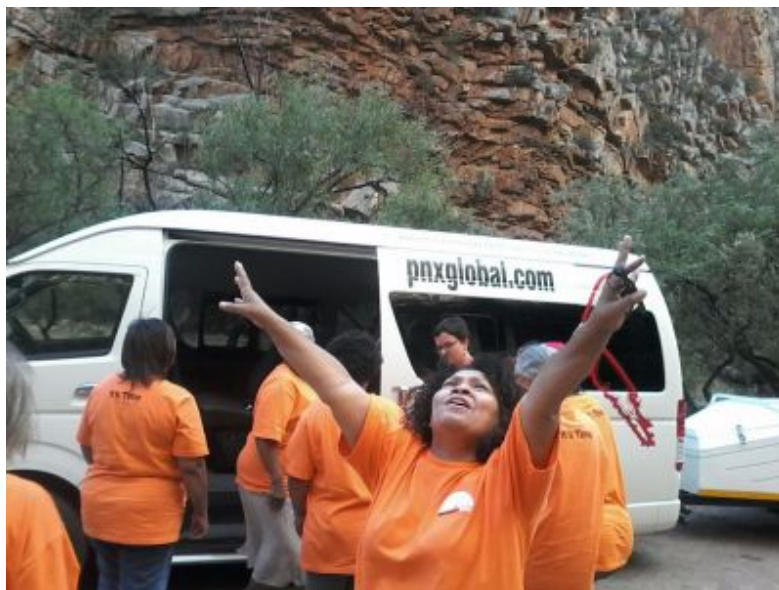
Roadside intercession break.