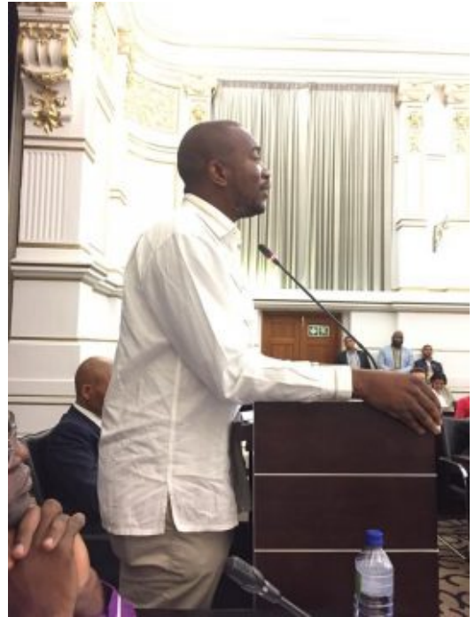
Mmusi Maimane addresses the meeting.

DA leader Mmusi Maimane spoke of the need to urgently address the challenge of having “two nations within the nation”, with some living in abundance, while others were poor. While government could legislate on this matter, Maimane expressed a desire to see those who have an abundance come to a place of repentance like Zacchaeus in the Bible. He was a rich man who had gained some of his riches through extortion and greed. But when salvation came to his house, he repented and gave half of his riches to the poor and committed to restore four times back to those he had cheated. Maimane stressed the need for repentance – a key that would open hearts to share wealth.