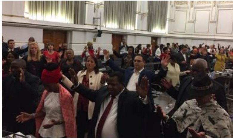
Leaders from various spheres in prayer in the Good Hope Chamber.