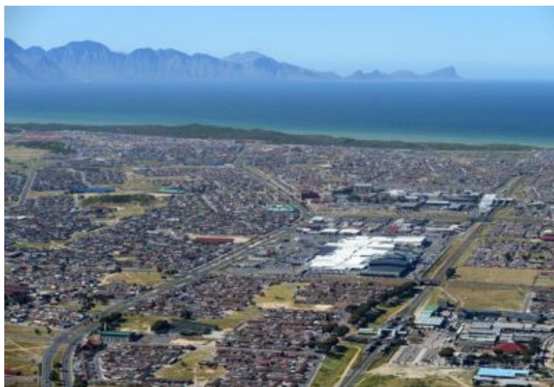
Mitchell's Plain, Cape Town.

God had also spoken clearly to him through a Scripture Union devotional written by a man who ran a drug rehabilitation centre in the impoverished, gangster-ridden Cape Flats area, that the prayer day should be in Mitchell's Plain.