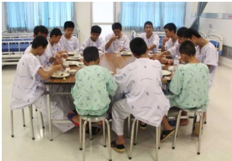
The team recovering in hospital.

“I want to be a Navy SEAL because I want to help others,” one of the players added.