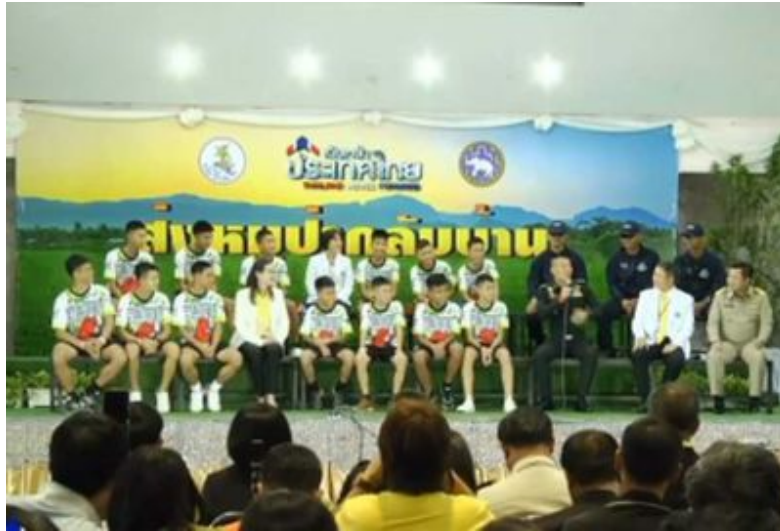
The rescued Thai soccer team holding a press conference.