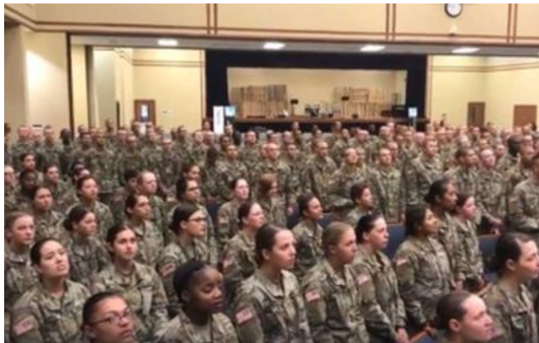
Troops at Fort Leonard Wood, Missouri.