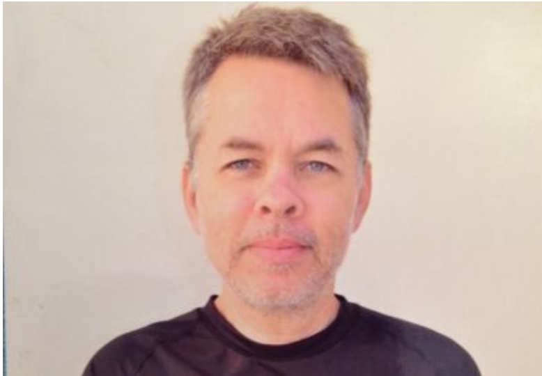
Pastor Andrew Brunson, pictured in January.

Originally published in World Watch Monitor