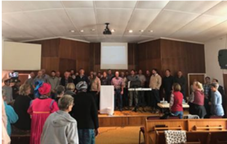
Farmers and their families singing Hoza Moya .