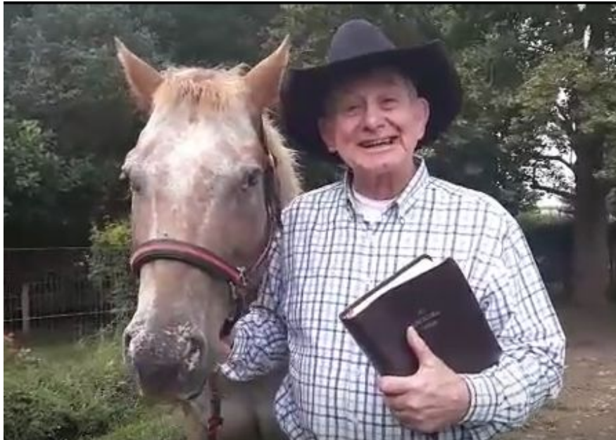
Angus Buchan calling on South Africans to participate in a national day of prayer

Farmers in the Bloemfontein area have offered approximately 800ha of land just 4km from the city centre for staging a national day of prayer for an envisaged one million people from all over South Africa, says the event visionary Angus Buchan.