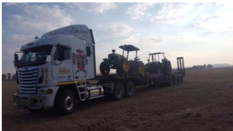
One farmer brought his two tractors

New farm roads have been opened and widened to ease traffic flow. More than 8 000 litres of diesel has already been donated to, and used by the farmers in land preparation.