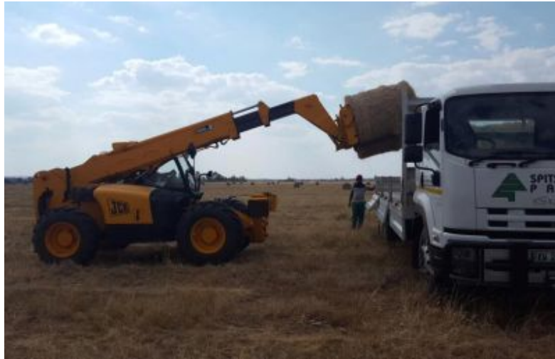
Preparations for the It's Time national prayer day on April 22.

Farmers and volunteers are pitching in to help with the mammoth task of preparing the "It's Time" prayer venue and surrounds near Bloemfontein to cope with an anticipated million people at the event on Saturday April 22, report the organisers.