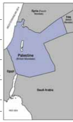
British mandate of Palestine